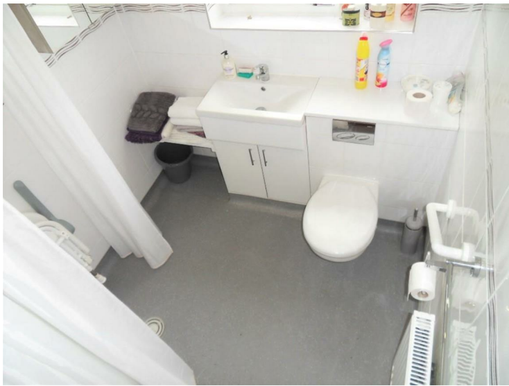
Low level w.c, wash hand basin with vanity unit below, wall mounted shower unit, tiled walls, rear aspect double glazed window.