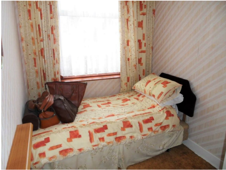
Front aspect double glazed window.