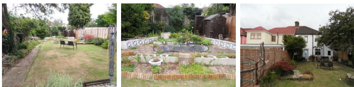
Concrete area, rest mainly laid to lawn area with mature shrub borders, feature fish pond (not used) with shrub borders, timber shed.